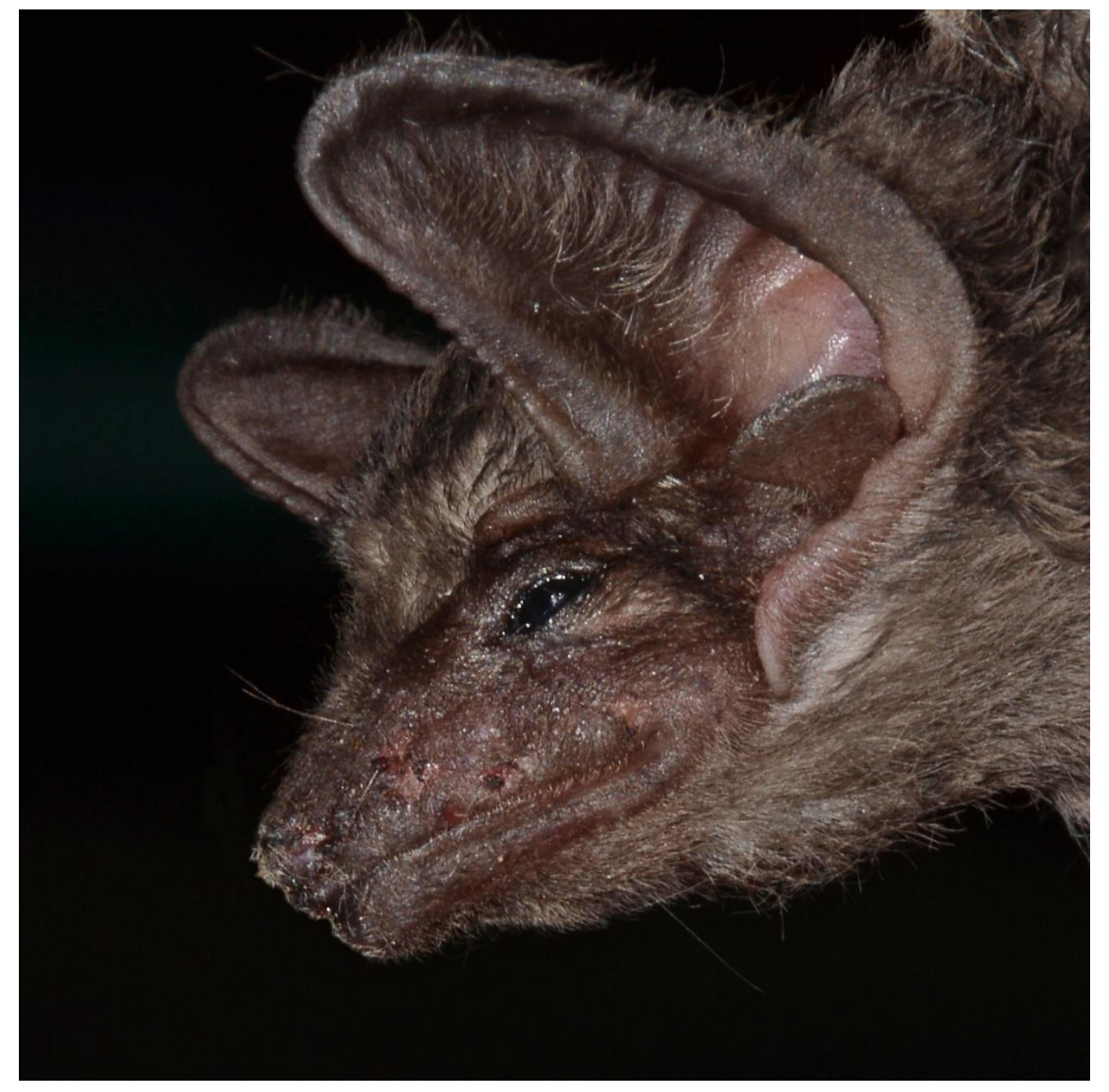
Figure 2. Lateral view of Taphozous melanopogon from Cu Lao Cham

The individuals were captured by Hoang Quoc Huy without equipment for sound recording. A recent study of emballonurid bats including this species indicated that echolocation calls of Taphozous melanopogon from offshore habitats are different in comparison with those of the mainland populations (Thong et al., unpublished data). Therefore, echolocation calls of the Cu Lao Cham population must be investigated for an acoustic assessment through its distributional range.