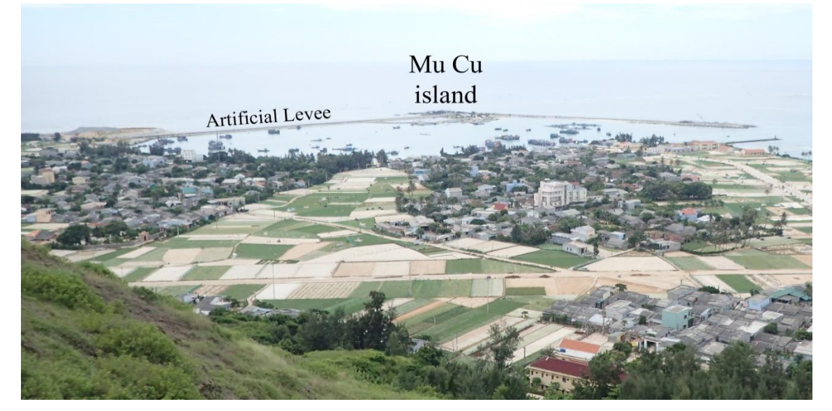
Figure 1. Mu Cu and Cu Lao Re islands of Ly Son have been connected since 2017

attractive destination for tourists since 2007. The development of tourism and agriculture has led to an extraordinary change of natural habitats in the archipelago. Therefore, the remaining natural vegetation within Ly Son has been largely reduced and fragmented. It is remarkable that, prior to 2017, terrestrial plants and animals of the archipelago were unstudied and, as consequence, its vertebrates had never been included in any previous publication. In order to expand knowledge about the bat faunas in Cu Lao Cham and Ly Son, we conducted a series of field surveys for an assessment of their diversity and conservation status. This paper provides information of the bat species recently recorded over the recent surveys.