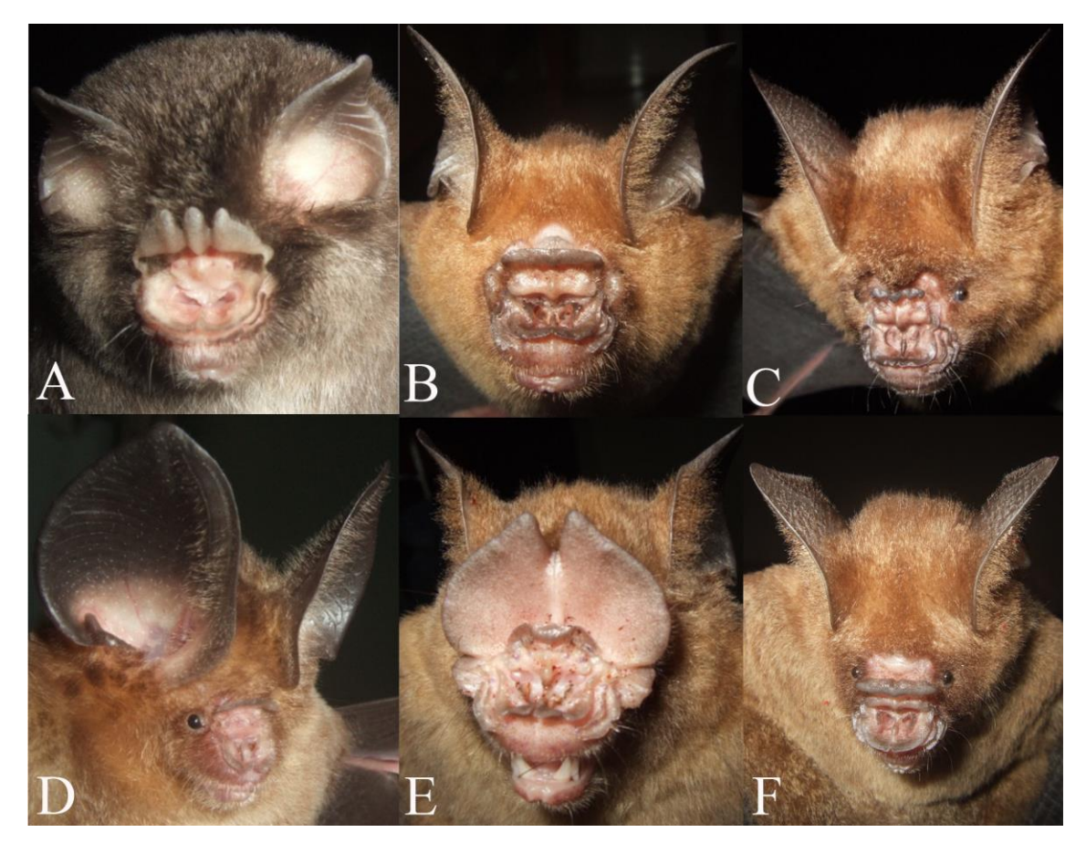
Figure 1. Frontolateral view of Aselliscus stoliczkanus (A), Hipposideros alongensis (B), Hipposideros armiger (C), Hipposideros gentilis (D), Hipposideros lylei (E) and Hipposideros poutensis (F) from Cuc Phuong National Park

The smallest species found in the park is H. gentilis with an average forearm length of 42.0 mm (40.3-43.0 mm). It was distinguishable from the others based on the combined traits of body size, noseleaf structure, and echolocation call frequency. Its noseleaf structure is quite simple without supplementary leaflets (Fig. 1D). As a hipposiderid species, each echolocation signal of this species also comprised a short constantfrequency component followed by a frequency modulated sweep. The captured individuals emitted their calls with the CF2 values in a range of 126.3-129.0 kHz (Table 1).