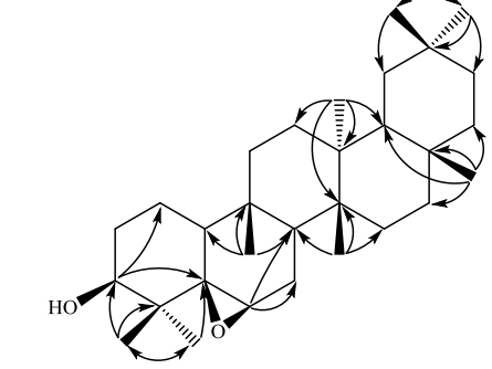
Figure 2: The key HMBC correlations of 1

synthesized from alnus-5-ene- 3\beta -ol [9]. This is the first report from nature.